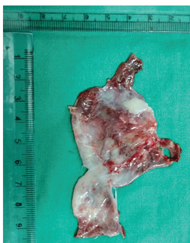
Fig. 2: Cyst wall after complete excision of the cyst

Odontogenic keratocysts arise from cell rests of dental lamina and can be defined as “a benign uni or multicystic