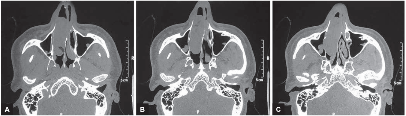
Figs 1A to C: Computed tomography scan (axial cuts) shows polypoidal mass in right nasal cavity