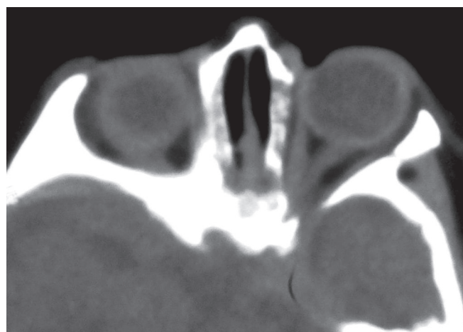
Fig. 1: Noncontrast computed tomography scan nose was done which showed posterior choana blocked with bony plates on both the sides. the paranasal sinuses, orbit and anterior nasal cavities were within normal limits

First described in 1755 by Roederer, congenital choanal atresia (CCA) is an infrequent anomaly, occurring in approximately 1 in 5,000–8,000 births. 1 Of these cases, 45% are bilateral. It is a condition that describes narrowing or obliteration of the posterior nasal aperture. It occurs more commonly in female patients. 2 It has been