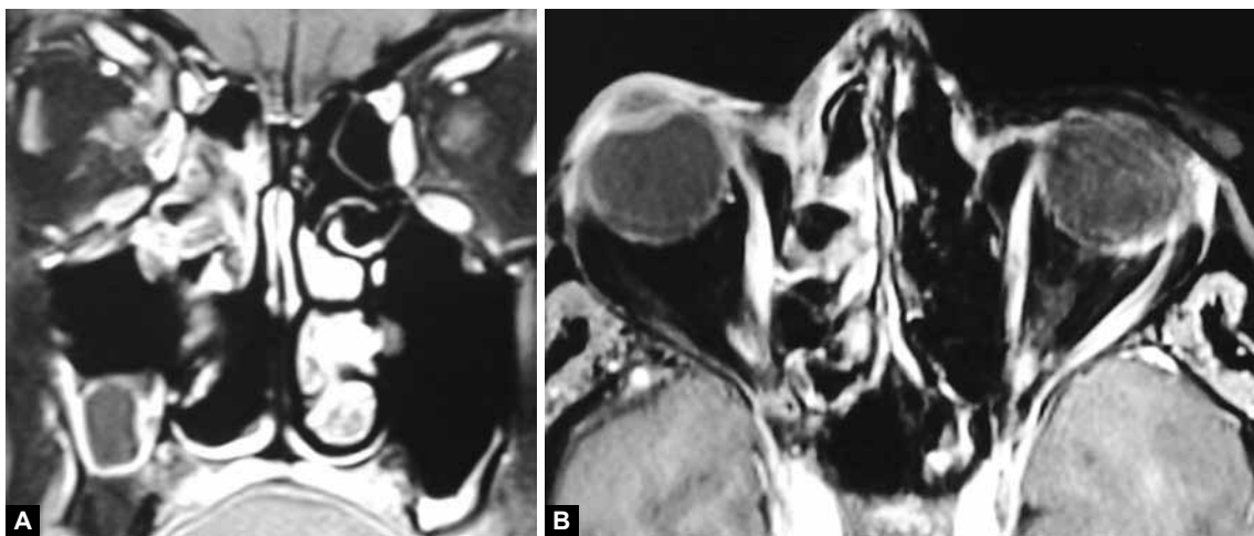
Figs 3A and B: T1-weighted MRI showing hypointense lesion in right ethmoids