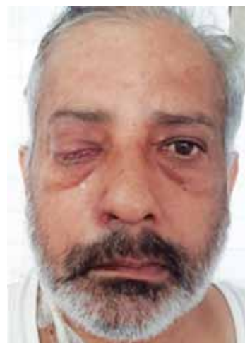
Fig. 1: Patient with right ptosis