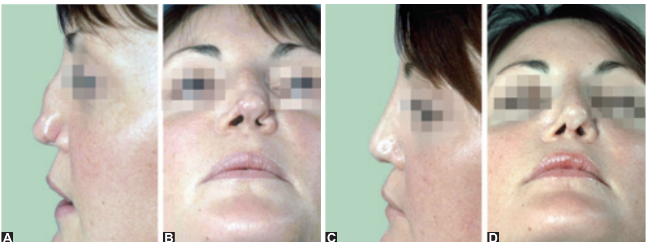
Figs 3 A to D: (A) Preoperative lateral view showing dorsal bony hump and loss of dorsal septal cartilage. (B) Preoperative basal view showing loss of left lower lateral cartilage resulting in alar collapse. (C) Postoperative lateral view following reconstruction of the cartilaginous dorsum with Medpor ® implant. (D) Postoperative basal view after reconstruction of the left alar cartilage using Medpor ® graft

Complex nasal deformities resulting in significant loss of the nasal skeleton often require large volumes of graft material. Autologous tissue remains the gold standard for nasal grafting material. It has unparalleled biocompatibility compared with alloplastic materials, and the subsequent risk of infection or protusion is far lower. 13,14 For most nasal deformities, septal cartilage is the primary choice of graft material. It is available from the same surgical field with no significant additional morbidity associated with tissue harvest. Its only limitation is the limited availability, particularly in cases where the deformity results from loss of septum, as was the case in almost all patients in our series. Alternative autologous cartilage from the pinna can provide large quantities of cartilage, but it may have some contour irregularities which in our opinion makes it unsuitable for dorsal augmentation. It is also comparatively thin and weak, which we may make it less suitable for structural support.