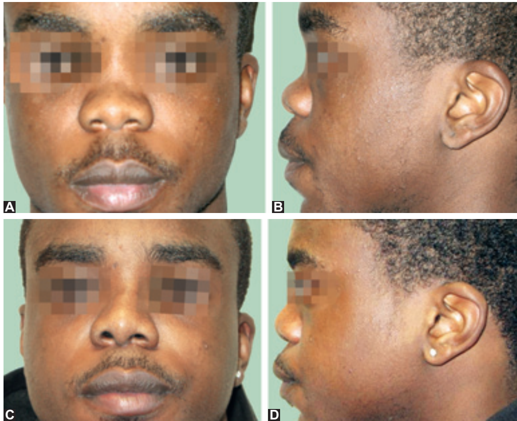
Figs 4A to D: (A) Preoperative frontal view showing a straight, wide dorsum. (B) Preoperative lateral view showing saddle nose deformity. (C) Postoperative frontal view at 5 weeks shows the slipped dorsal implant, resulting in scoliosis of the upper dorsum to the left. (D) Postoperative lateral view (5 weeks) following reconstruction with Medpor ® dorsal implant, showing good dorsal support with satisfactory lateral profile

The other main source of autologous cartilage is from costal cartilage. Rib grafts can provide both cartilage and bone, and can yield large volumes. However, there is potentially significant morbidity associated with tissue harvest, including pain, a chest scar or possible pneumothorax. Rib cartilage grafts also have a recognized tendency to warp when used in the dorsum, leading to postsurgical deformity. Other sites of bone grafts from the iliac crest or calvarium also have similar donor site morbidity. In addition, bone grafts are naturally more rigid and harder to sculpt. For any of these alternative sources of autologous tissues, harvesting separate graft material from a different surgical site requires an additional incisional wound and has potential associated morbidity and risks, which maybe unacceptable to the patient or considered unnecessary by the surgeon. Furthermore, graft harvesting from a separate surgical field will require additional operative time.