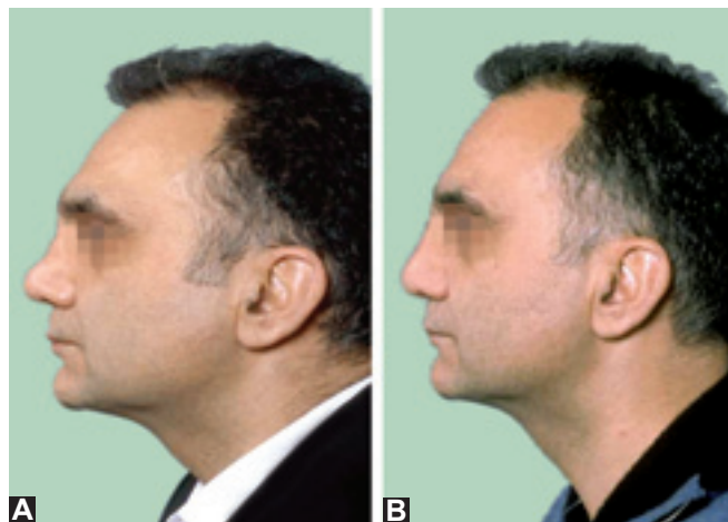
Figs 1A and B: (A) Preoperative lateral view showing saddle nose deformity. (B) Postoperative lateral view following reconstruction with Medpor® dorsal implant (Case 1)

A 45-year-old man was referred with a saddle nose deformity, which resulted from a previous septoplasty (Figs 1A and B). He underwent augmentation rhinoplasty using a Medpor® dorsal graft. A satisfactory outcome was obtained.