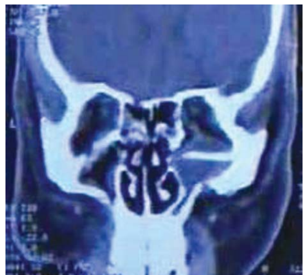
Figure 3: Coronal CT scan showing displaced silastic sheet in maxillary sinus

Early diagnosis and treatment of a blowout fracture is extremely important since the prognosis in such cases is excellent. It is therefore important that all patients, in whom a blowout fracture is suspected, should be followed carefully for several days after the initial injury. In our study, most