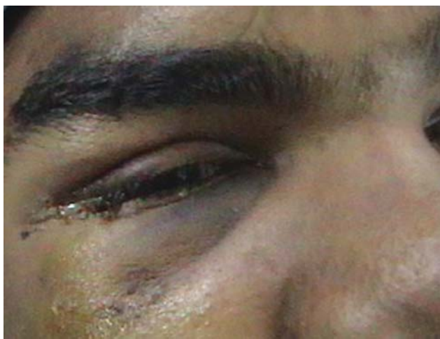
Figure 1: Clinical picture of patient with right orbital blow out fracture

Most of the patients who presented with orbital floor fracture were in the age group of 18 to 45 years as this is the most susceptible age group for accidental injuries. Majority of the patients, i.e. >75% were repaired late, i.e. after 1 month due to delayed presentation. All the six patients who were